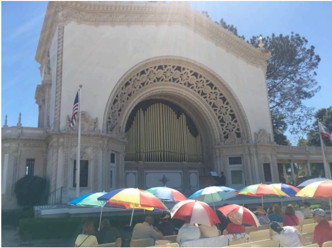
The afternoon audience was very supportive, even if they were hidden behind a sea of sun-blocking umbrellas.