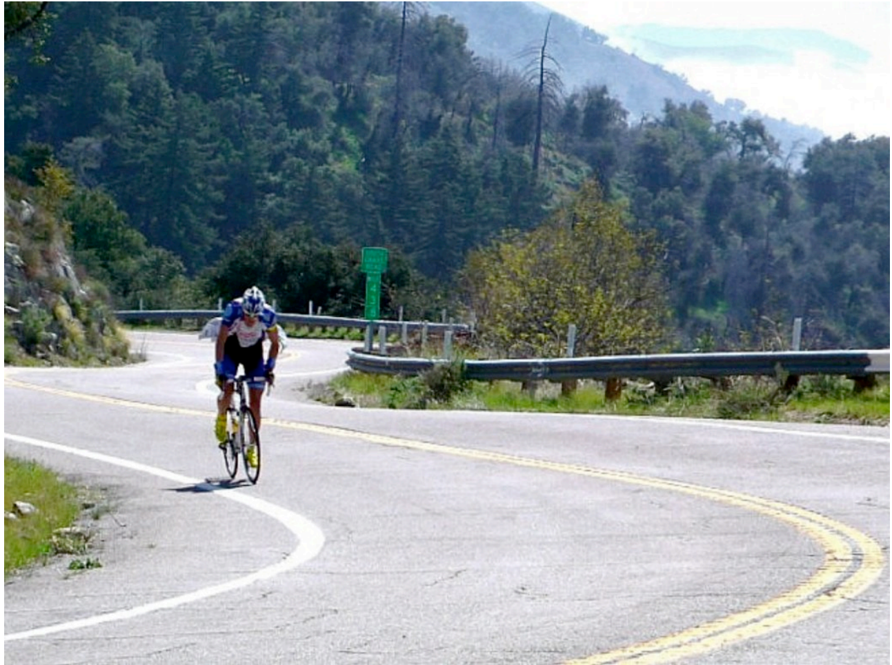
Bicyclist ascending Palomar Mountain.