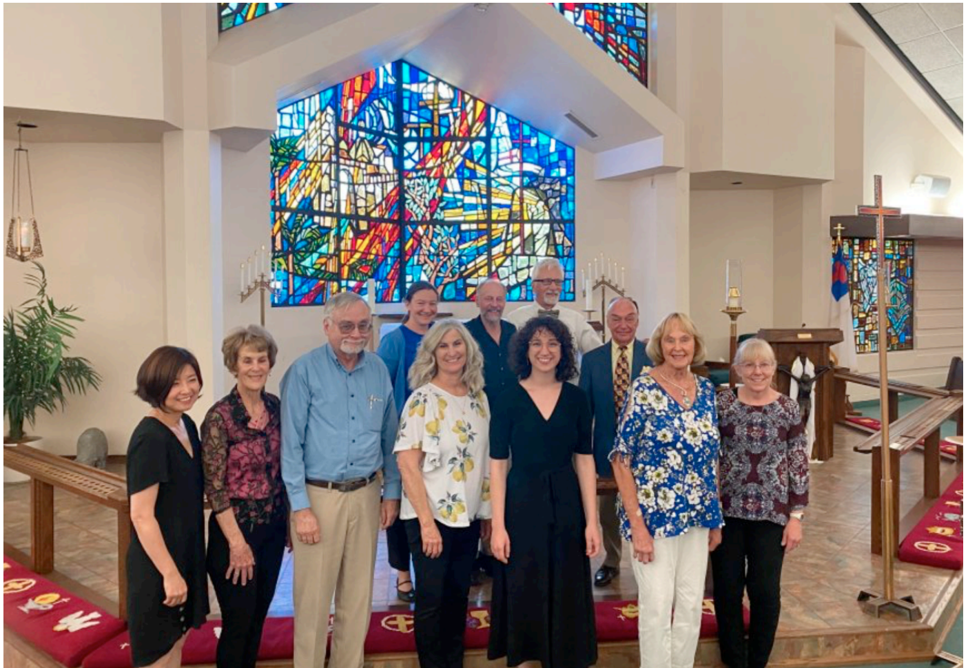
Performers at our Chapter Members' Recital at Gloria Dei Lutheran Church, Escondido.