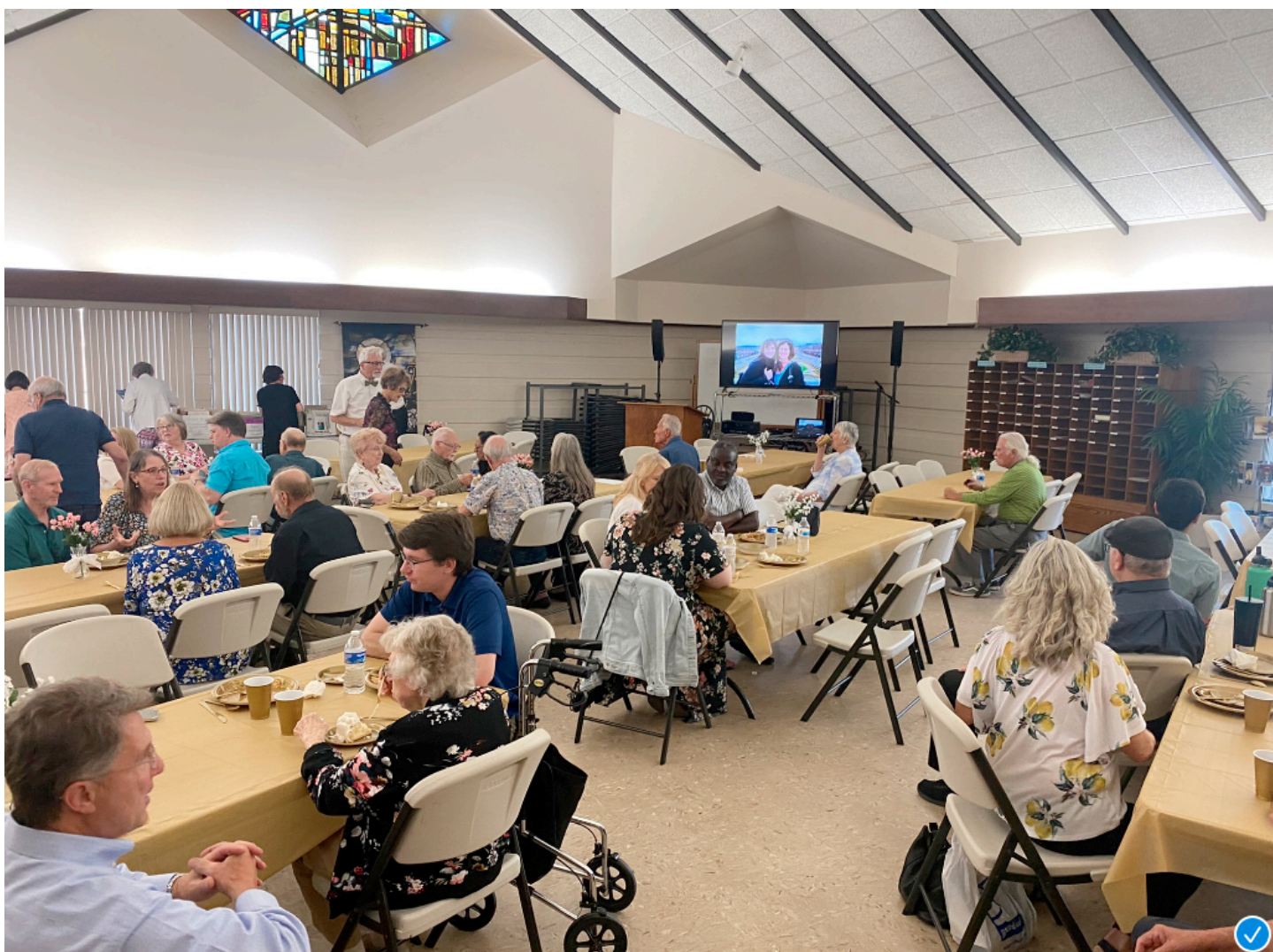
Taco Dinner in the Social Hall.